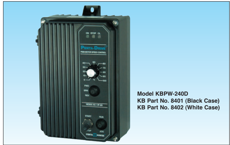
Model KBPW-240D KB Part No. 8401 (Black Case) KB Part No. 8402 (White Case)