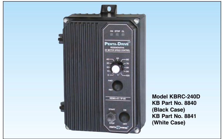
Model KBRC-240D KB Part No. 8840 (Black Case) KB Part No. 8841 (White Case)

Note: * Requires CE RFI filter KBRF-200A (KB P/N 9945) or equivalent.