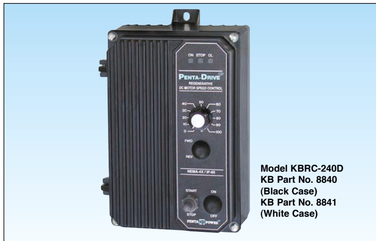
Model KBRC-240D KB Part No. 8840 (Black Case) KB Part No. 8841 (White Case)

Note: * Requires CE RFI filter KBRF-200A (KB P/N 9945) or equivalent.