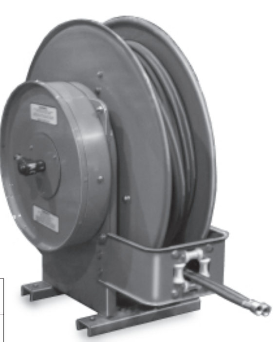
Model H60 oxygen-acetylene reel. Hose guide with rollers is standard. Hose not included, but may be ordered from and installed by Gleason.