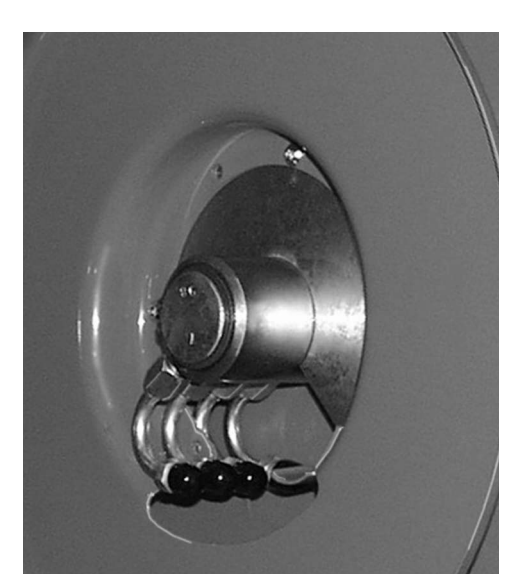
"Goose-necks" plus integral ramp assure smooth hose transition between manifold and reel spool.