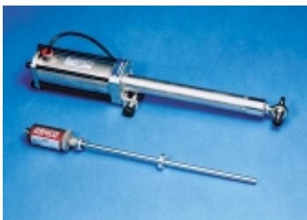
Series 951 LDT, 952 BlueOx™ LDT (not pictured) and 950 MD Mill-Duty Housings