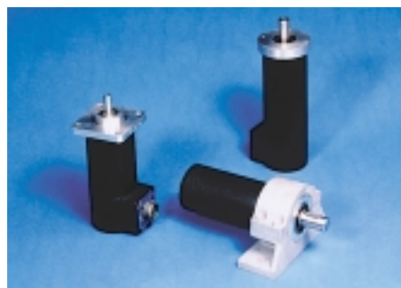
Series 1986 Standard Resolver Packages Gemco is a trademark of Patriot Sensors & Controls Corporation.