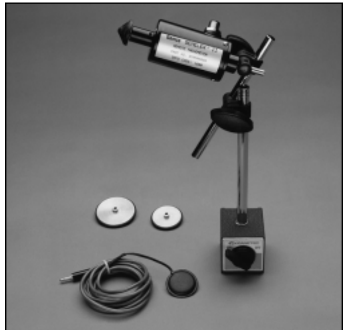
Semelex II Safetimeter Optional Equipment

Optional Manual Start Switch is used to simultaneously initiate an E-Stop condition and the stop time calculation in the Safetimeter. The switch can be placed upon a safety mat used for machine guarding. Stepping on the switch synchronizes the stop time calculation with the safety mats E-Stop output signal.