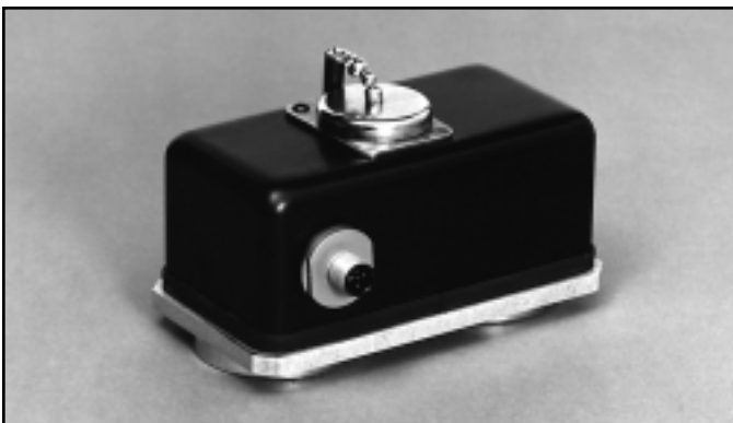
Heavy-Duty Position/Velocity Transducer

Counterbalance can be easily checked by measuring the down- and up-stroke stop time. When these two times are the same, counter-balance is properly set.