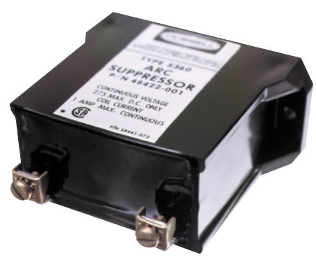
Type 5360 Arc Suppressor