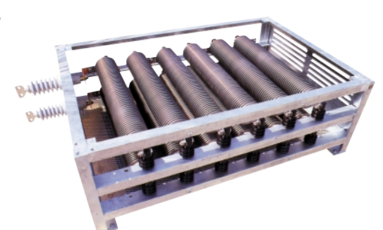
Edgewound Resistive Elements in Open Frame