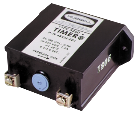
Type 5350 Static In-Line Timer