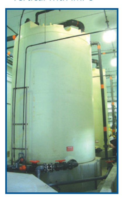
IMFO® Integrally Molded Flanged Outlet