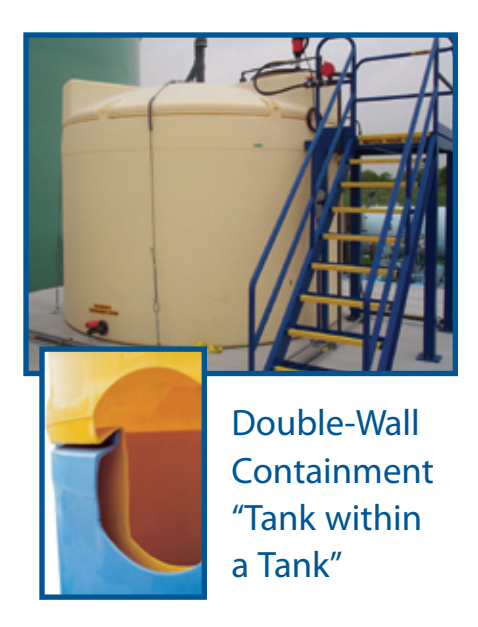
See page 28 for more information

SAFE-Tank<sup>®</sup> BELLOWS STYLE SECONDARY TRANSITION FITTINGS WITH PVC NIPPLE: AVAILABLE IN 2", 3" AND 4".