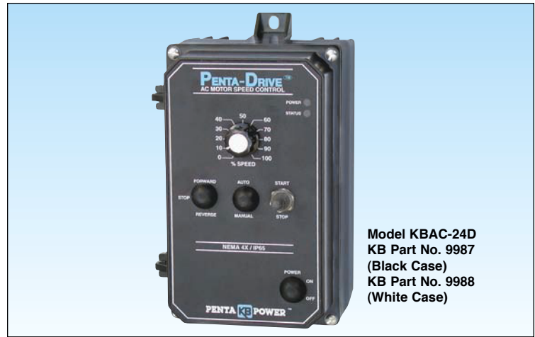
Model KBAC-24D KB Part No. 9987 (Black Case) KB Part No. 9988 (White Case)