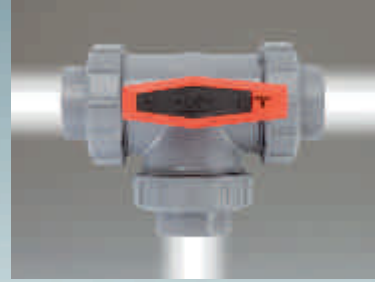
Basic position for mixing function