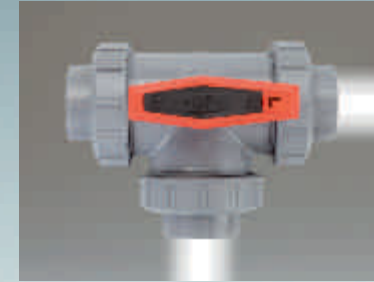
Basic position for diverting function