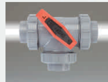
Outlet closed, passage open with reduced flow