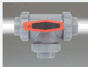
Outlet closed, passage open