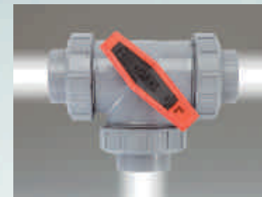
Mixing function with reduced flow