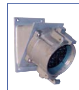
Female Receptacle with Angle Adapter 37-C4003-SS + MA3SS