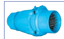
Male Inlet with Handle (Plug) 63-C8003 + 61-6A013

A typical order should include an inlet part number, a receptacle part number AND the matching handles, angles or other required accessories.