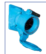
Female Receptacle with Angle Adapter 63-C4003 + 61-6A027