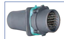
Male Inlet with Handle (Plug) 37-C8003-SS + 3H1SS

A typical order should include an inlet part number, a receptacle part number AND the matching handles, angles or other required accessories.